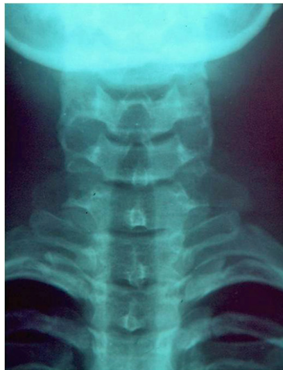
Figure 1: Cervical plain radiograph of a 10-year-old girl indicated elongated C7 transverse process on both sides that was more pronounced and symptomatic on the left side.

Common local anomalies include an elongated transverse process of the seventh cervical vertebra, variations in the insertion of the anterior scalene muscle (ASM) or scalenus minimus muscle, the presence of a cervical rib, fibrous and muscular bands or hypertrophic scar tissue after clavicle fracture, variations in insertion or local hypertrophy, in athletes, of pectoralis minor, atypical course of neurovascular structures or abnormalities of the first thoracic rib. An elongated transverse process of the seventh cervical vertebra is the most commonly recognized cause of TOS (Figure 1). It is considered elongated if it extends beyond the tip of the first thoracic vertebra process immediately below it, as seen on cervical radiographs. A fibrous band connecting it to the first rib may also be evident.