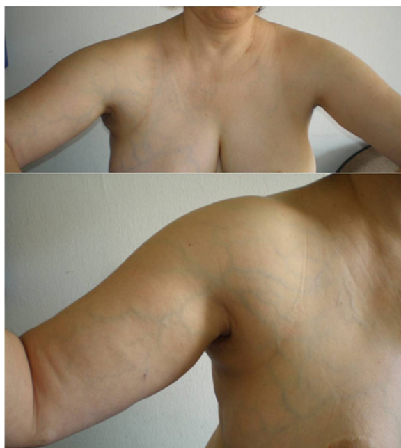
Figure 4: A 41-year-old woman with a diagnosed Paget-Schroetter syndrome 6 weeks ago. Clinical pictures showing diffuse swelling and dilated prominent veins on the right side of the chest, shoulder, arm and breast.

Furthermore, Paget-Schroetter disease, also known as Paget-von Schrötter disease, or primary 'effort-induced thrombosis' remains largely an unfamiliar disease and the incidence of patients leaving the hospital undiagnosed is high. It is a form of upper extremity deep vein thrombosis, a medical condition in which blood clots form in the axillary or subclavian veins. They have the potential to cause a pulmonary embolism. The syndrome is commoner in young people who are engaged in competitive sports. It is differentiated from secondary causes of upper extremity caused by intravascular catheters. Symptoms may include sudden onset of pain, warmth, redness, blueness and swelling in the arm (Figure 4).