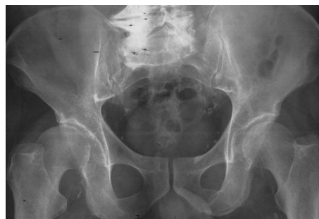
Figure 2: Anteroposterior radiograph of the pelvis and hips reveals no evidence of a fracture line, but degenerative changes of the lumbar spine and of the right hip as well as extensive calcification of the femoral arteries.

The clinical suspicion of an occult hip fracture necessitated further imaging of the patient. Imaging evaluation included ultrasonography, scintigraphy, computed tomography (CT) and magnetic resonance imaging (MRI). Ultrasonography showed no findings suggesting vascular disorders. Echogenic atherosclerotic plaques were evident on the arteries of the lower extremities. A fluid-signal, avascular muscle lesion in the area of the right iliopsoas muscle was diagnosed Figure: 3. A conventional 3-phase bone scintigraphy (300 MBq) with technetium-99m HDP indicated increased uptake of the soft tissues around the right hip joint in the early phase, as well as increased uptake of the upper femur consistent with degenerative arthritis or fracture. Contrast-enhanced CT of the abdomen revealed a soft tissue lesion consistent with a chronic hematoma in resolution, depicting fluid signal intensity and a slightly thick wall, in the area of the right iliopsoas muscle. There was no evidence of a fracture. There was also no relation of the lesion with the right femoral vessels Figure 4.