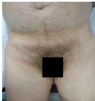
Figure 1: Clinical presentation of a 67-year-old patient with a painful swelling of the right groin following a fall from a height a month ago.

Physical examination revealed a painful right groin swelling Figure: 1. A palpable tender mass was felt in the right iliac fossa next to the iliac crest. There was a 20 degrees flexion contracture of the right hip and a diminished hip range of motion in 2 planes, including flexion and internal rotation. Pain was severe with weight bearing. When in bed the hip was held in lateral rotation. Surgical and genitourinary evaluation revealed no evidence of a hernia or any other disorder. Neurological examination revealed no abnormal findings. Manual muscle testing as well as pinprick and light touch sensation of the lower limbs were normal. Plain radiographs indicated findings of degenerative osteoarthritis of the hip, but no fracture line Figure: 2. Laboratory test results were within normal limits. The patient's coagulation profile and platelet counts were normal.