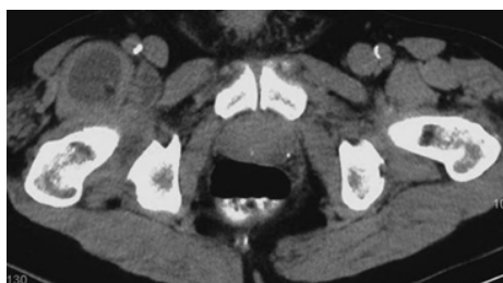
Figure 4: Contrast-enhanced axial computed tomography of the abdomen shows the soft tissue lesion with fluid-signal density in the area of the right iliopsoas muscle.

It was considered best not to attempt percutaneous drainage. He was restricted from bearing weight on the affected limb when using crutches for a month, and was kept on partial weight bearing for another month. Local symptoms and signs showed notable improvement 3 months post-injury. A new MRI performed at 3 months after injury indicated considerable reduction in the size of the hematoma. Full weight bearing was then allowed. The local symptoms and signs that were due to the hematoma, including the palpable mass in the iliac fossa, pain on ambulation, flexion contracture and supine hip external rotation, were completely relieved after 6 months. Symptoms that were due to the right hip osteoarthritis, including morning stiffness, exertional hip pain and limited hip flexion and internal rotation range of motion, were still evident. There was no recurrence of the lesion within 12 months.