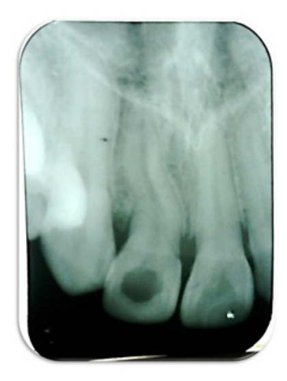
Figure 1: Flexion of root in relation to 11.