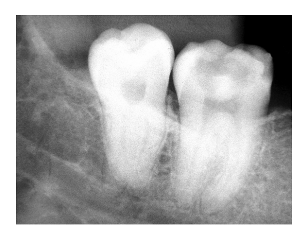
Figure 5: Initial radiograph of the second lower left molar (Case 2).

After choice of the post, the endodontic treatment was carried out: the tooth was isolated with a rubber dam and the access to the root canal system was performed. After preparation of the entrance to the root canals, working length was determinated using a foraminal locator (Propex Pixi, Dentsply-Maillefer).