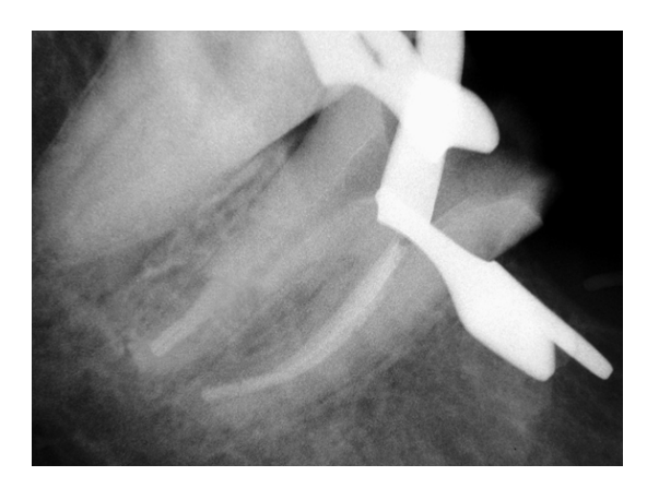
Figure 8: The gutta-percha cutting performed 5 mm from the working length in distal root canals.

Adhesive system (Dry and Wet bond, Superdont, São Paulo, Brazil) was then applied on root canal wall by means of extra-fine applicators (Endo Tim, Voco GmbH, Cuxhaven, Germany). Then, the fiberglass posts with dual resin sealer (Superpost CoreCement, Superdont, São Paulo, Brazil) were inserted at distal root canals (Figure 9). Next, they were photopolymerized for 40 seconds with a LED light curing unit (Demi Plus).