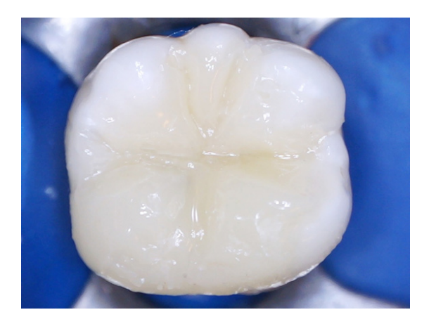
Figure 10: Final restoration with coronary build-up using bulk-fill flow and additional layer of composite resin.

The coronary build-up was carried out using composite resin (GrandioSO, Voco GmbH, Cuxhaven, Germany) to complete restoration (Figure 10). The final radiograph was take (Figure 11A), and the patient was referred to a prosthodontist.