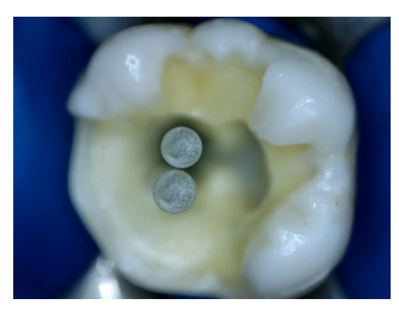
Figure 7: Visual test carrried out to verify its adaptation to root canal.