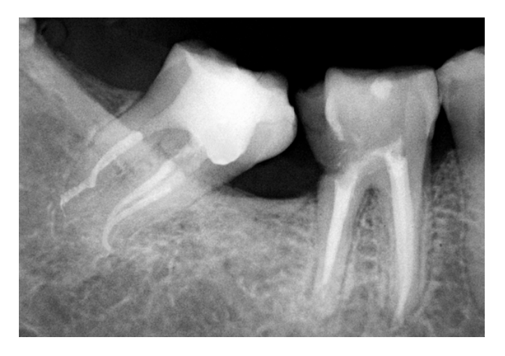
Figure 4: Final periapical radiograph of the case 1 showing complete endodontic treatment and restoration tooth by direct technique.