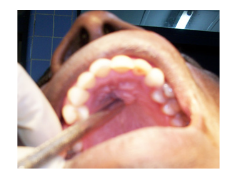
Figure 2: Palatal prominence in the area of the periapical lesion.

Finally, the canal was filled with the mixture of calcium hydroxide and hydroxyapatite, until the apical foramen was completely filled, followed by the temporary sealing of the duct to prevent micro leaks. A new periapical X-ray was taken to observe the correct filling of the canal root leaving the drug into the canal until the new follow-up period (7, 30, 90, 180, 270 and 360 days). At each time, the signs and symptoms were clinically evaluated and an X-ray was taken to determine the presence or absence of drug in the duct. The material was removed only if there was any alteration of the parameters evaluated and the situation was reflected in the NDC.