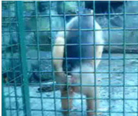
Figure 1: Scratching Behavior