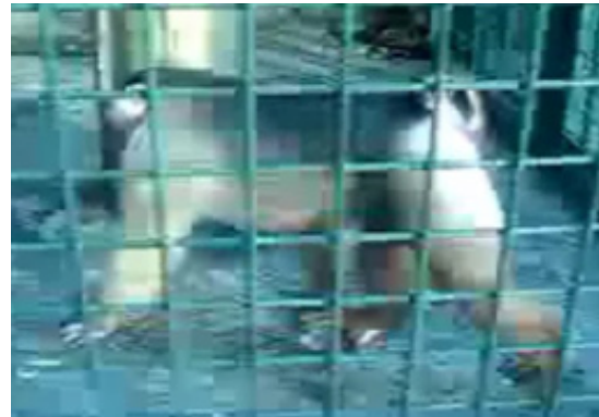
Figure 4: Stereotypic Behavior

Figure 3: The function of stimulus repetitions on duration of scratching behavior (sexual excitement).